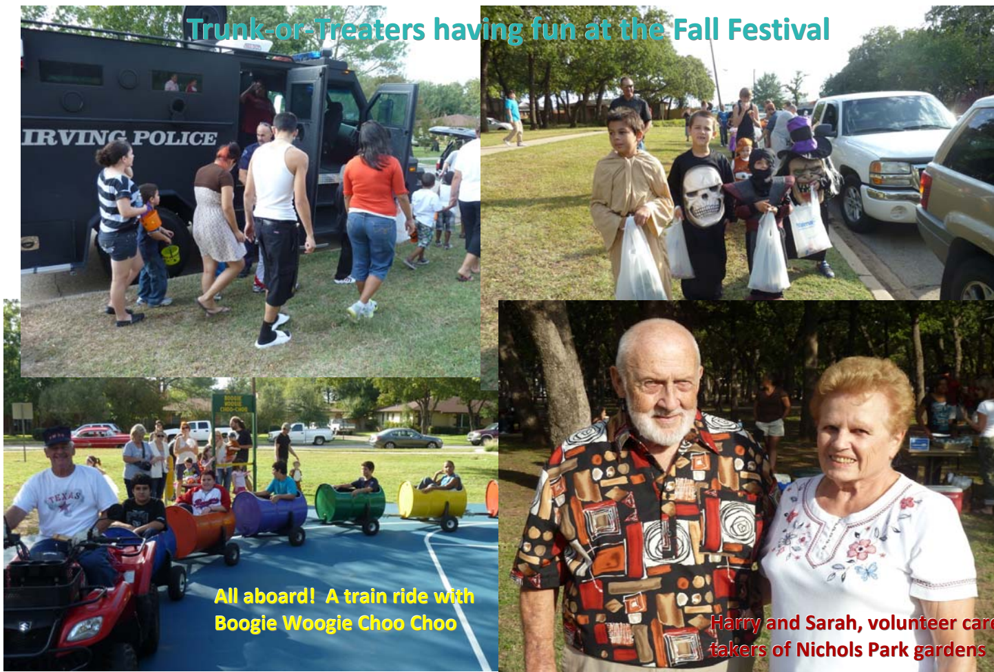
Trunk-or-Treaters having fun at the Fall Festival